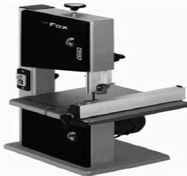
FOX model F28-182A