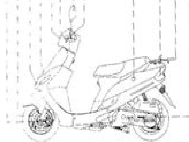
(Disk brake/7 seat)