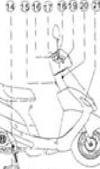
drum brake/1 seat)