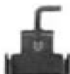
BLADE REMOVAL TOOL 490-850-0005