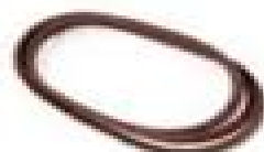
DRIVE BELT 490-501-C061