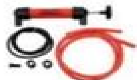
SIPHON PUMP 490-850-0008