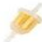
FUEL FILTER 490-202-C004