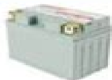
AGM BATTERY T25P17335

Refer to the parts list label under the lawn tractor's hood for original equipment parts.