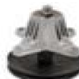
SPINDLE ASSEMBLY 618P09259