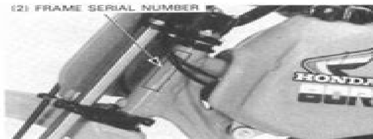
(2) FRAME SERIAL NUMBER

The frame serial number is stamped on the left side of the steering head.