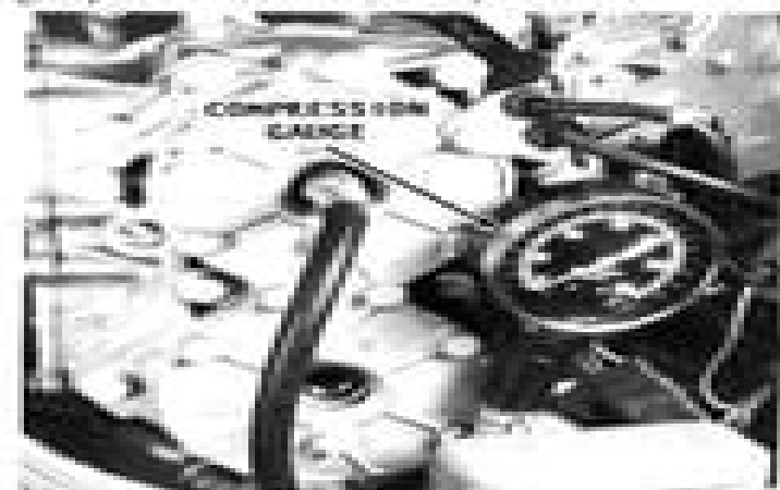
A compression check should be taken in each cylinder before spending time and money on tune-up work. Without adequate compression, efforts in other areas to regain engine performance will be wasted.

Remove the spark plug wires. ALWAYS grasp the molded can and pull it loose with a