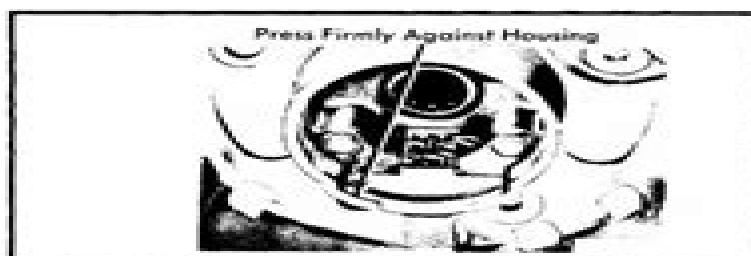
Fig. 7 View Showing Proper Positioning of Brush Leads

NOTE — Dished washers are to be used only on circuit board with exposed diodes. If dished washers are used on single circuit board, short circuit will occur.