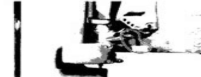
1. Normal position

This system allows cruising in shallows by inclining the outboard motor 20 degrees, although previously this was not possible.