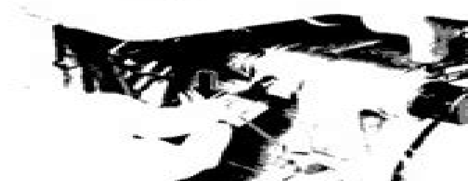
1. Tilt lever