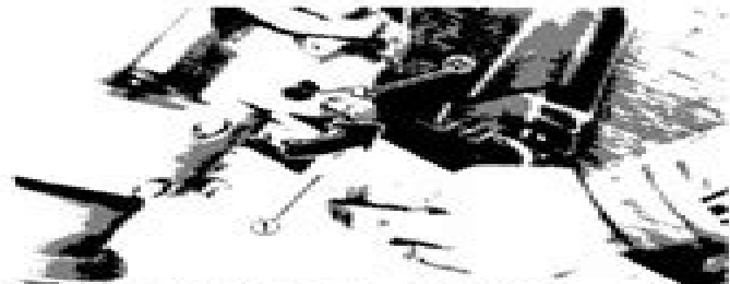
1. Shallow water drive lever 2. Stopper