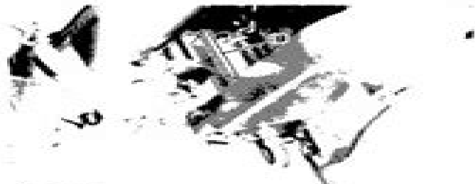
1. Tilt rod