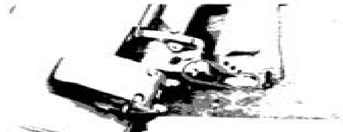
1. Set position