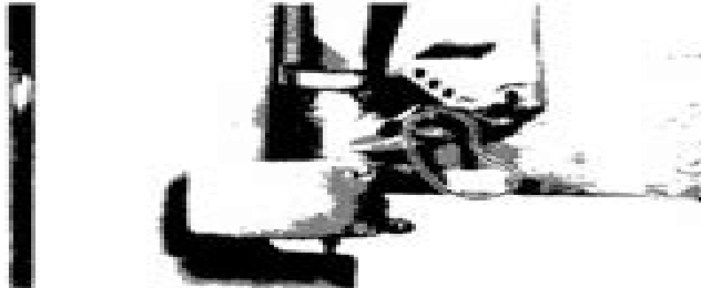
1. Normal position

This system allows cruising in shallows by inclining the outboard motor 20 degrees, although previously this was not possible.