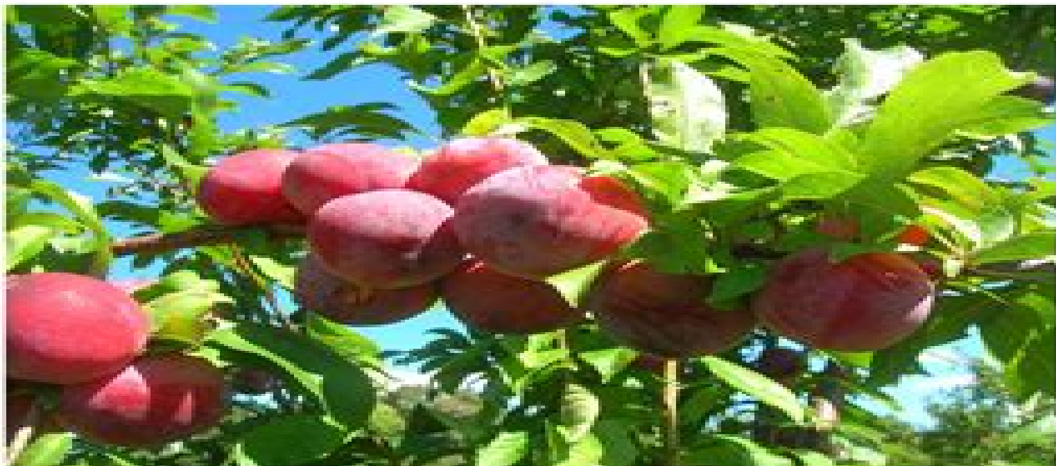
'Vander' is a Japanese-type plum from a Wickson x Blueback cross, released from the University of Guelph in Verdland, Ontario in 1984. This mid-season variety has red skin and yellow flesh, large size, and good flavor.