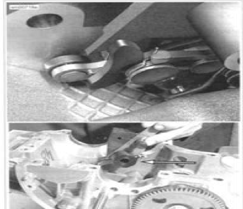
Figure 6-37. Shift Mechanism/Retractor (HD-45339)