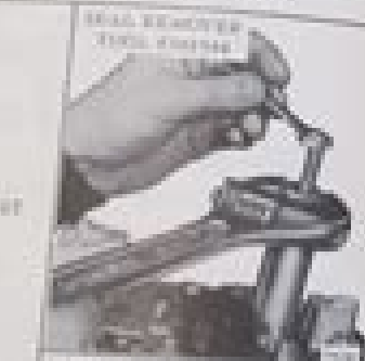
Figure 3-1. Power Head Attaching Device

2. Remove power lines and place on back the ap-