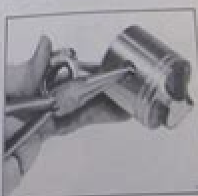
Figure 1.10. Summing Word For Pairwise Study

2. Measure the rings from the bottom by jerrying the ends down enough to grip them with gloves and then breaking them apart from the potter. DO NOT try to move the rings apart when they are not stuck. Instead,