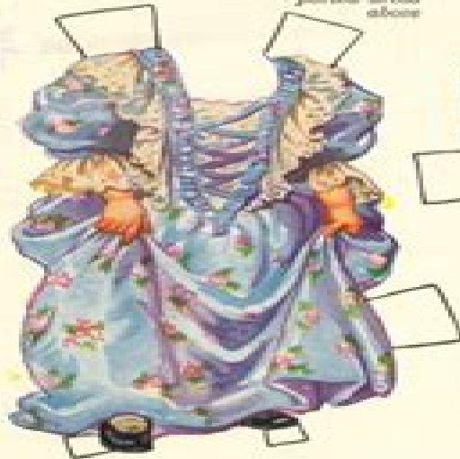
Judy's im- ported dress above

B EFORE you cut out the twins paste the whole page to a sheet of heavy paper or thin muslin and press it flat under a weight. When it is dry, cut around the outlines with your scissors. Be careful not to snip off any of the tabs. They are to be bent back.