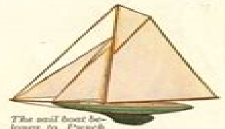
The sail boat be- longe to Punch