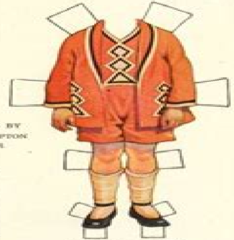
Punch has a twin suit to match Judy's imported one

B EFORE you cut out the twins paste the whole page to a sheet of heavy paper or thin muslin and press it flat under a weight. When it is dry, cut around the outlines with your scissors. Be careful not to snip off any of the tabs. They are to be bent back.