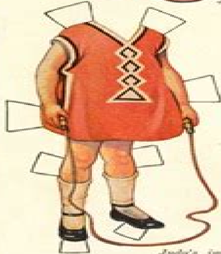
They're now seven years old