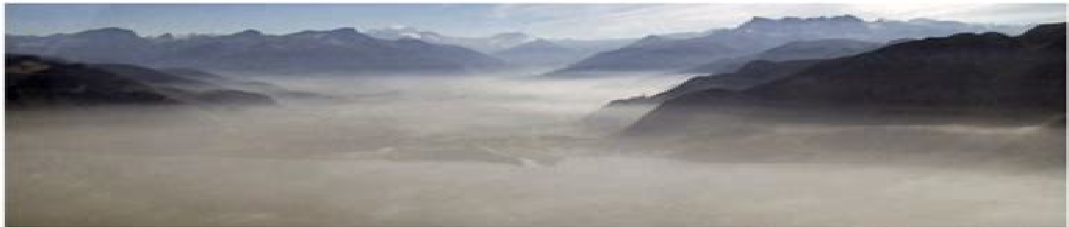
View over Lake Geneva, Switzerland

Haze Reduction, Atmospheric and Topographic Correction