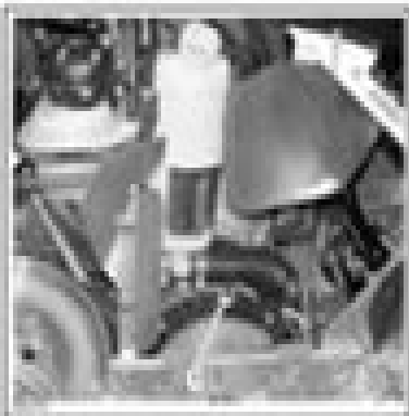
1. Connect fuel system, remove air engine

Unplug from the coolant reservoir the hose going to the engine.