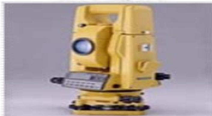
Electronic Total Station GTS-2R series 1988