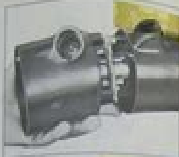
Fig. 1-15 Shock absorber assembly