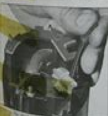
Fig. 1-19 Rear suspension assembly

3. Remove the coil spring from the rear suspension.