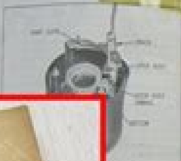
Fig. 1-16 Rear suspension assembly