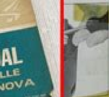
Fig. 1-17 Rear suspension assembly