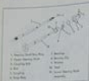
Fig. 1-14 Front suspension assembly