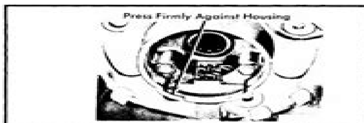
Fig. 7 View Showing Proper Positioning of Brush Leads

NOTE — Dished washers are to be used only on circuit board with exposed diodes. If dished washers are used on single circuit board, short circuit will occur.