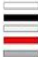
Small white plug x13598