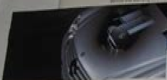
Factory Approved Service Products for