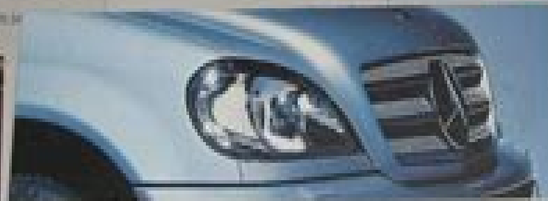
W-Class Operator's Manual