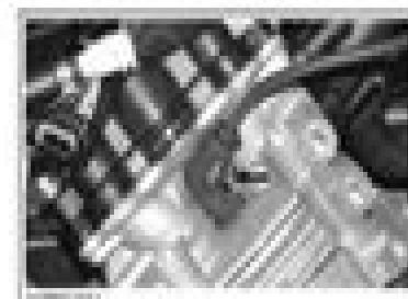
Image 61-8 THE OTHER FRONT PLUMB CABLE