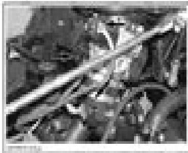
Image 61-6 CONNECTORS FROM THROTTLE BODY AND WIRING HARNESS