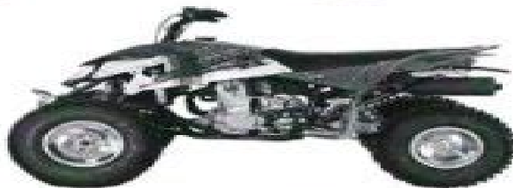
OUTLAW 525 S