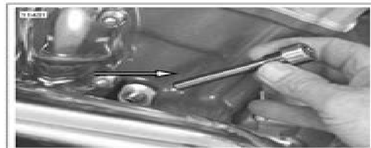
Figure 3-20. Crankshaft Locking Pin