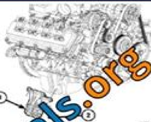
Fig. 14: Engine Mount & Fasteners