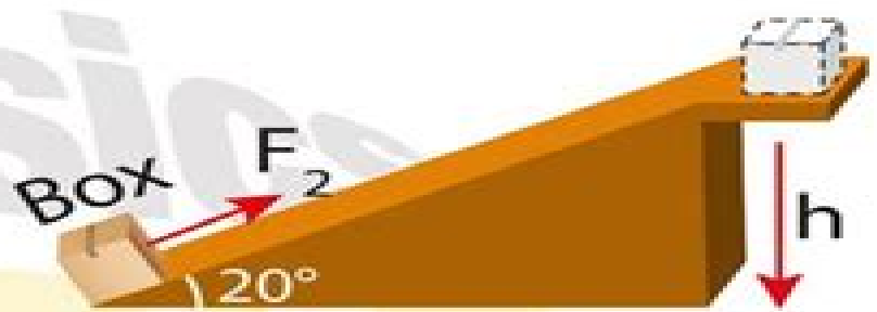
Figure - 2