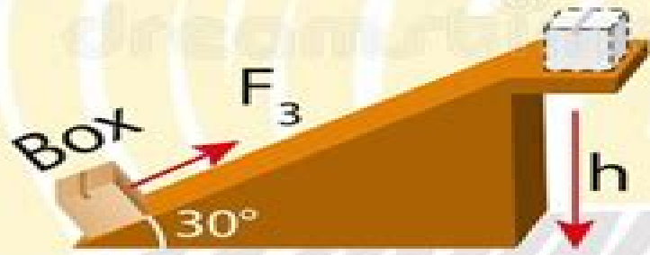
Figure - 3