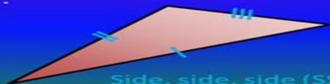
Side, side, side (SSS)