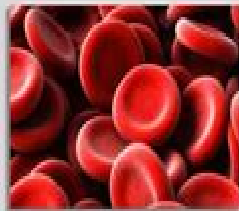
Red blood cells