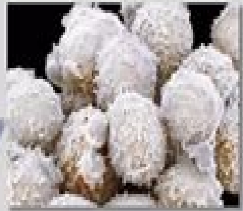
White blood cells