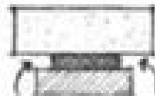
Gate segregates public-private