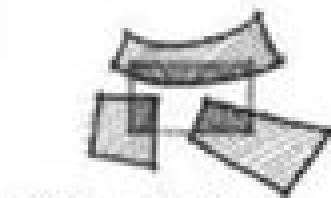
Odd shapes intrude on "pure" space