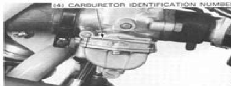
(4) CARBURETOR IDENTIFICATION NUMBER

The carburetor identification number is stamped on the right side of the carburetor.