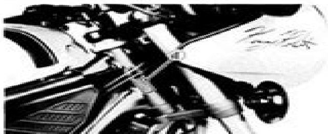
1. Vehicle identification number

The vehicle identification number is on the right side of the steering head pipe.