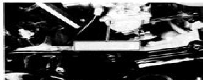
1. Engine serial number

The first three digits of these numbers are for model identification; the remaining digits are the unit production number.