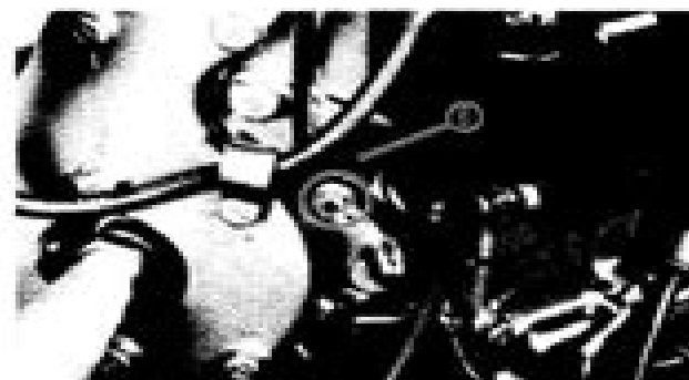
1. Knock sensor