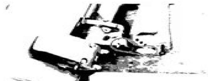
1. Set position