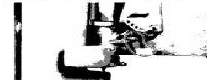
1. Normal position

This system allows cruising in shallows by inclining the outboard motor 20 degrees, although previously this was not possible.