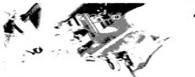
1. Tilt rod