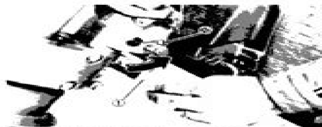
1. Shallow water drive lever