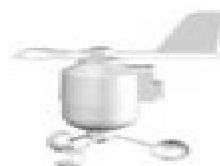
1 x Wind Sensor (1 x Wind Vane Above and 1 x Anemometer Below)