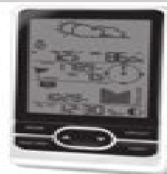
1 x Base Station