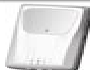
1 x Temperature / Humidity Sensor